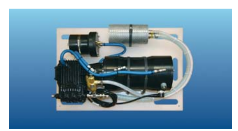
WATER JET SLEDGE