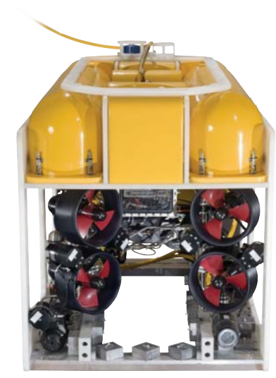
PANTHER-XT PLUS SHOWING TOOL SLEDGE COMPARTMENT