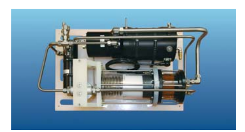
4 KW HPU